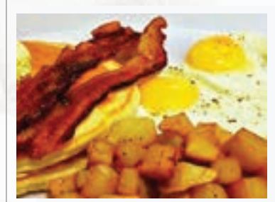
Peña's Classic #$ ž "

Two eggs cooked your way, choice of meat, choice of country potatoes, hash browns, or grits, and two sweet cream pancakes.