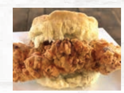
Southern Chicken Biscuit 5.50 Marinated, deep fried chicken breast on a biscuit.