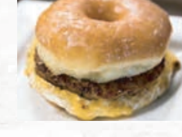
Peña's Donut Sandwich 5.50

Brisket, egg, cheddar cheese, grilled onions and BBQ sauce on a southern biscuit.