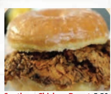
Southern Chicken Donut 5.50

Sausage patty on a warm southern biscuit.